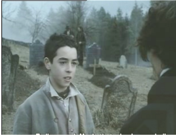
Movie: disk 1, 25.02: Young Masbath joins with Ichabod to revenge his father's death.