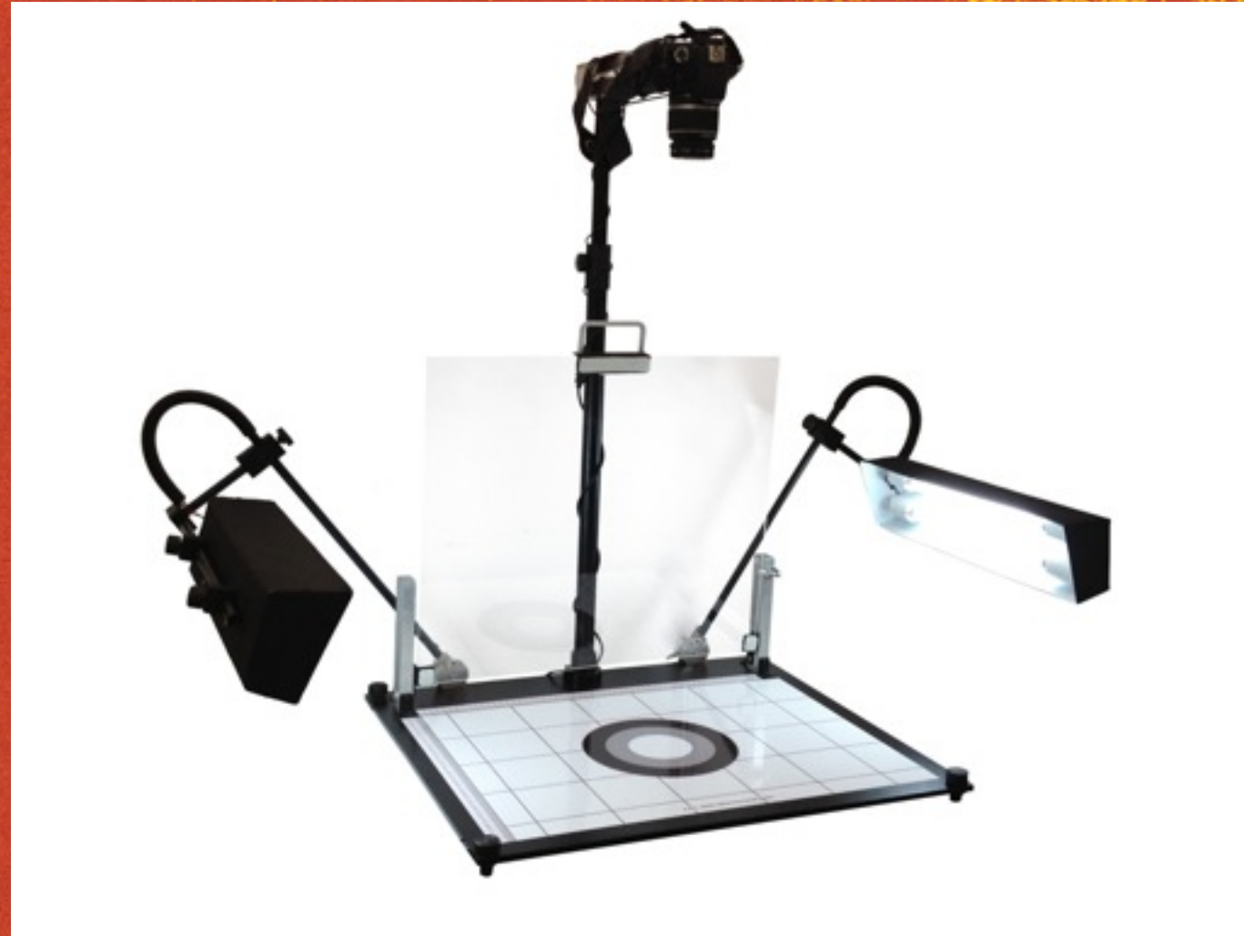
Heikelmedia DigiPro v2.0