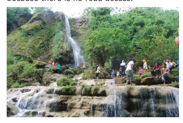
Figure 2. Sri Gethuk Waterfall

The village potential which can be found and developed into tourist village is, among other, natural potency. This potential is a water source. Bleberan Village has four (4) large water sources: Jambe water source with 40-60 liter per second flow-rate, Ngandong with 30 liters per second, Kedung Poh with 15 liters per second, and Ngumpul with 40-60 liter per second. All of this water sources end up in Sri Gethuk waterfall so that it has never been dry even in dry season. Nevertheless, Sri Gethuk waterfall cannot be utilized for farming irrigation by local community, because it flows to Oyo River, the location of which the stream is far lower than the community-owned farm. For that reason, this waterfall seems has no benefit and is ignored by local community. Moreover, the location of waterfall is far from the people's houses and less affordable because there is no road access.