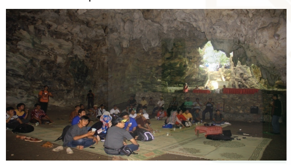
Figure 3. One of the rooms inside Rancang Kencono Cave

In addition to a water source, natural potencies this village has are Rancang Kencono Cave and Olden Times Site. Rancang Kencono Cave is the one replete with a story from prehistory age to Mataram soldier struggle age. The cave, in which Klumprit (terminalia edulis) grows and estimated more than two (2) centuries old, according to the local people, has been used to develop a strategic plan in the attempt of expelling Dutch colonial from Kasultanan Ngayogyakarta Hadiningrat. Because it was used to design a strategy for the lofty purpose, this cave was named Goa Rancang Kencono. Before 2010, this cave was not well-known to outsiders despite it's affordable and proximate location to the people houses. This cave has a wide room, thereby it can be used to hold a meeting. It is of course, interesting to everyone who wants to hold a meeting in an open and natural space. In addition to Rancang Kencono Cave, there is also old times site in Bleberan. This site is composed of tidily and regularly piled stones. This site is actually interesting, but because it has not been well-known to outsider, there are only few visitors have come to this place.