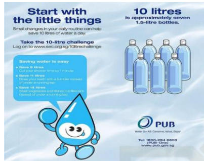
Figure 4. The 10-Litre Challenge [23].

use of 160 liters person per day in 2005 to 154 liters person per day in 2010. Expected continues to decline until 147 liters person per day in 2020.