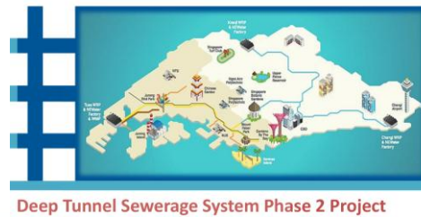
Figure 3. Deep Tunnel Sewerage System (DTSS) Phase 2 [22].

DTSS phase 1 was implemented in period 2000 – 2008 and phase 2 was started in 2014 and also in progress (PUB Annual Report, 2013/2014). The picture of DTSS Phase 2 can be seen in the figure below.