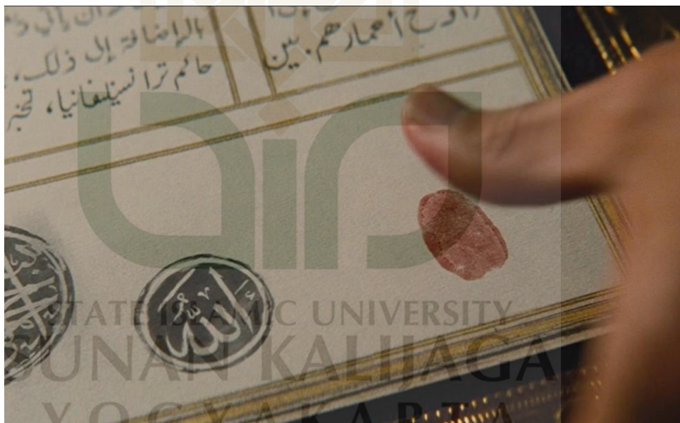
Fig. 1.1. Mehmed when signs the requirement

when Mehmed asks for a thousand children to be trained as Janissaries army, Vlad seemed doubtful but he tries to fulfill what Mehmed asks. Finally Vlad refuses to fulfill Mehmed's request that Mehmed wants Vlad's only son to live under Mehmed's sight and finally it makes Mehmed angry and attacks Transylvania. Overall, Vlad is really obedient to Mehmed. On the other side, Mehmed is described as a person with great ambition and if someone refuses his demand, war is the only way to solve it. The proof that Mehmed is a Moslem can be seen in the movie when Vlad and Mehmed are negotiating, there is an Arabic letter read as "Allah" and "Muhammad".