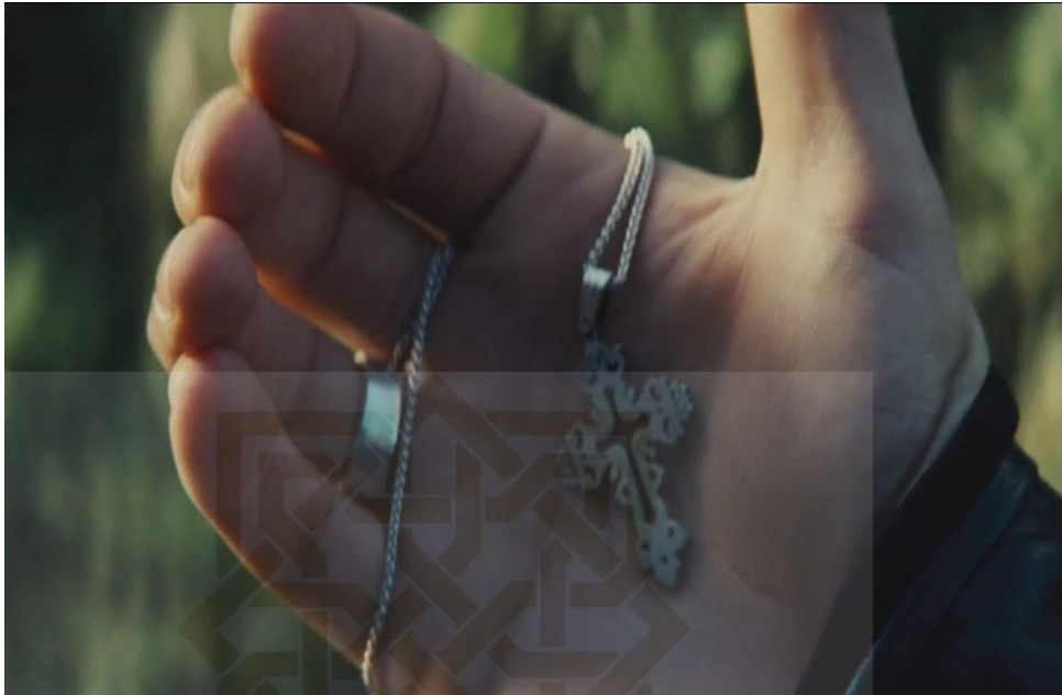
Fig. 1.2. Vlad is bringing his cross

Second, Mehmed and Islam are described as a powerful kingdom but wicked, and Vlad with his Christians' armies are described as a weak kingdom but kind. It can be seen through the movie when Mehmed's soldiers come to the Vlad's palace arrogantly in order to send a message from their sultan, Mehmed. They come without any respect as if they are better than Vlad and his people. Meanwhile, Vlad tries to soothe the strange situation in his palace and acts like a true hero for his people by his kindness. In this movie, the obedience of Vlad to Mehmed is not only because they Mehmed and Vlad are stepbrothers, but also because Mehmed has a powerful kingdom and armies that can destroy everything he wants in one attack. This is the reason why Vlad is always be good to Mehmed in order to keep his kingdom safe. The researcher analyses how bad and how good muslim in Dracula Untold movie. The last, the researcher also wants to analyse how movie which contains Islamic sign is described by a filmmaker, Gary Shore.