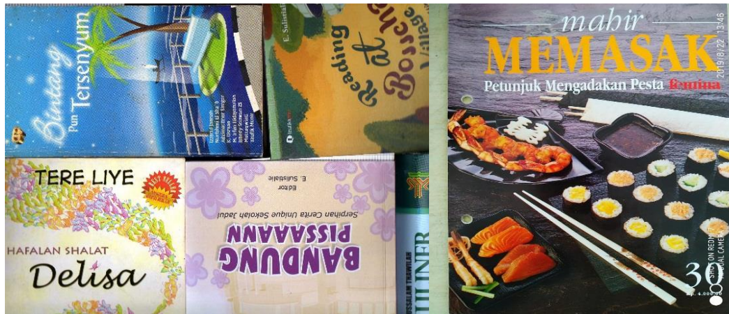
Fig 3: Books read by female population around Bosscha Observatory