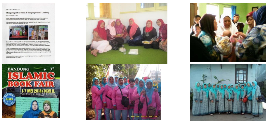
Fig 2: Activities of Information Literacy

The following is a brief explanation of result achieved. In the early of activities (2010-2013). Earlier if the women should visit book or Islamic exhibition as well as lecture at other mosque, the transportation fee were covered by the donation from Mr. Raharto's family, meanwhile for Islamic commemoration all society of RW 10 Bosscha Village funded it. Now, female population become independent as they could collect money for the transportation fee of Ustadzah who come to give monthly lecture at Nurul Islam mosque.