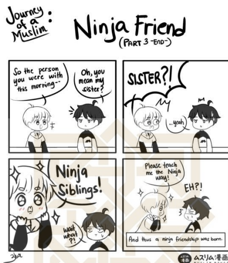
Figure : Journey of a Muslim Episode 15: Ninja Friend part 3

after the utterances. It can be the setting of the place, time, or condition. Below is the example of the analysis.