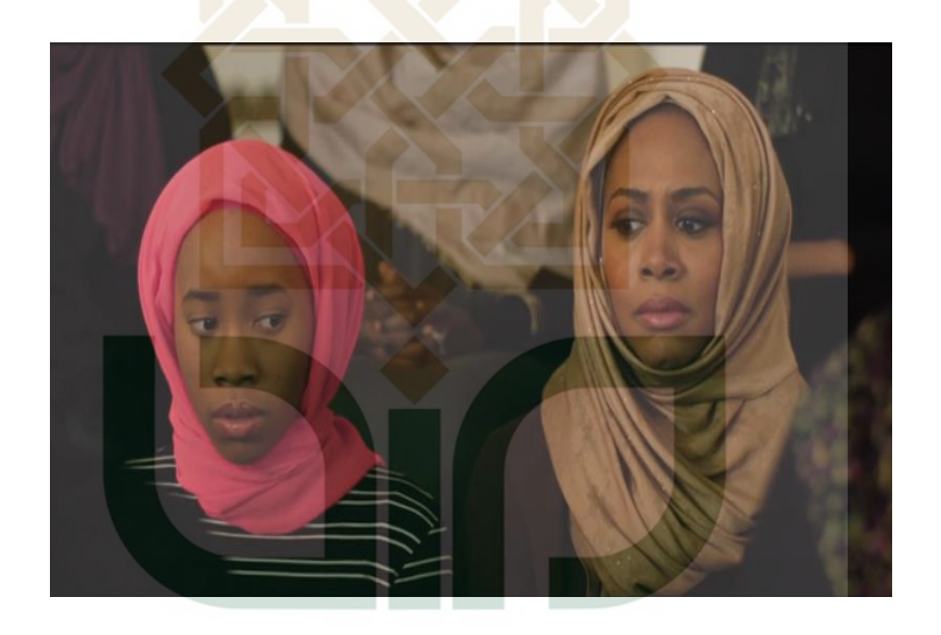
STATE Figure 01 . Summer and Jade S

in Jinn (2018) movie. Summer, the main character of the movie experiences a series of journey related to identity crisis during her identity formation. The story begins when Summer's mother, Jade experiences a spiritual awakening and converts to Islam. Later, Jade forces Summer to follow the same path. She told Summer to embrace and accept Islam as their new religion. As the result of converting to Islam, Summer finds herself difficult to switch between the old version of herself and the new version of her as a moslem in family and social environment, such school.