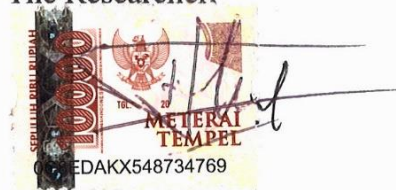
MOH AGUS MUSTOFA 16150082