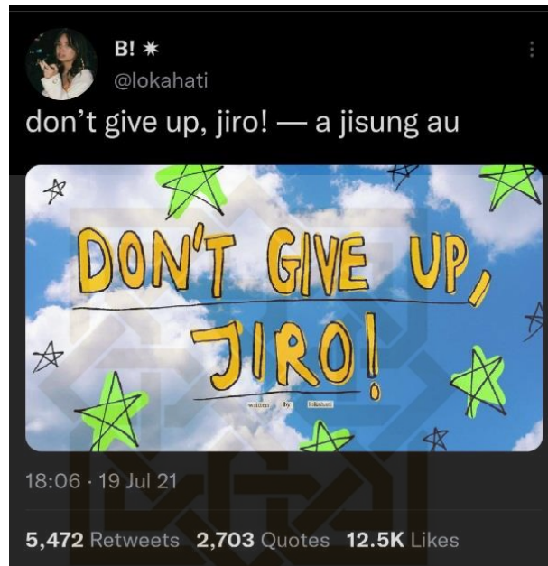
Image 1. 1 Example of Alternate Universe (AU) By @lokahati

romance, family, friend, comedy, horror, thriller, fluffy, angst, and slice of life.