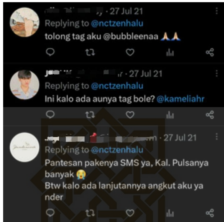
Image 1. 3 AU Readers' Comments on Base X Account @nctzenhalu

Komariyah & Rachmani (2022, p. 39) states that reading interest is a person's interest or desire in reading so that it creates motivation to study the subject further. Reading interest needs to be instilled from an early age. The importance of a person to have a high interest in reading is to add insight or knowledge to increase someone's intelligence so that the quality of human resources and education in a country will also increase.